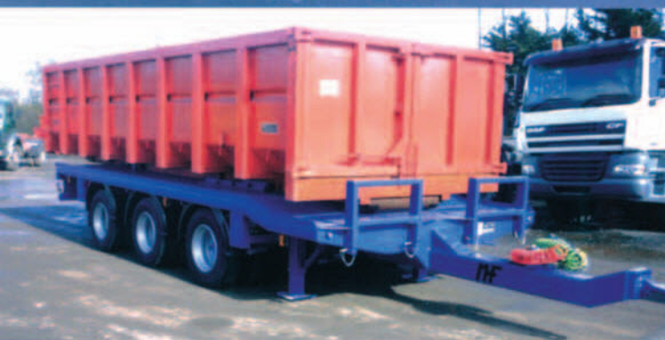
Flat bed 24 tonne GTW with cable bin